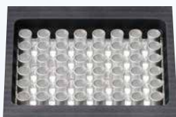
482 0.2ml×48 tubes