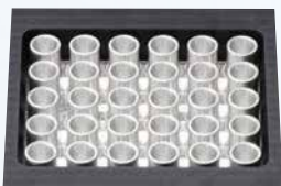
485 0.5ml×30 tubes