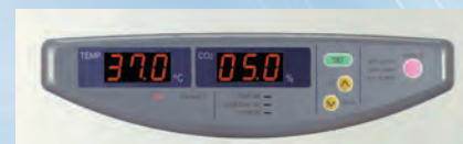
CO 2 Incubator