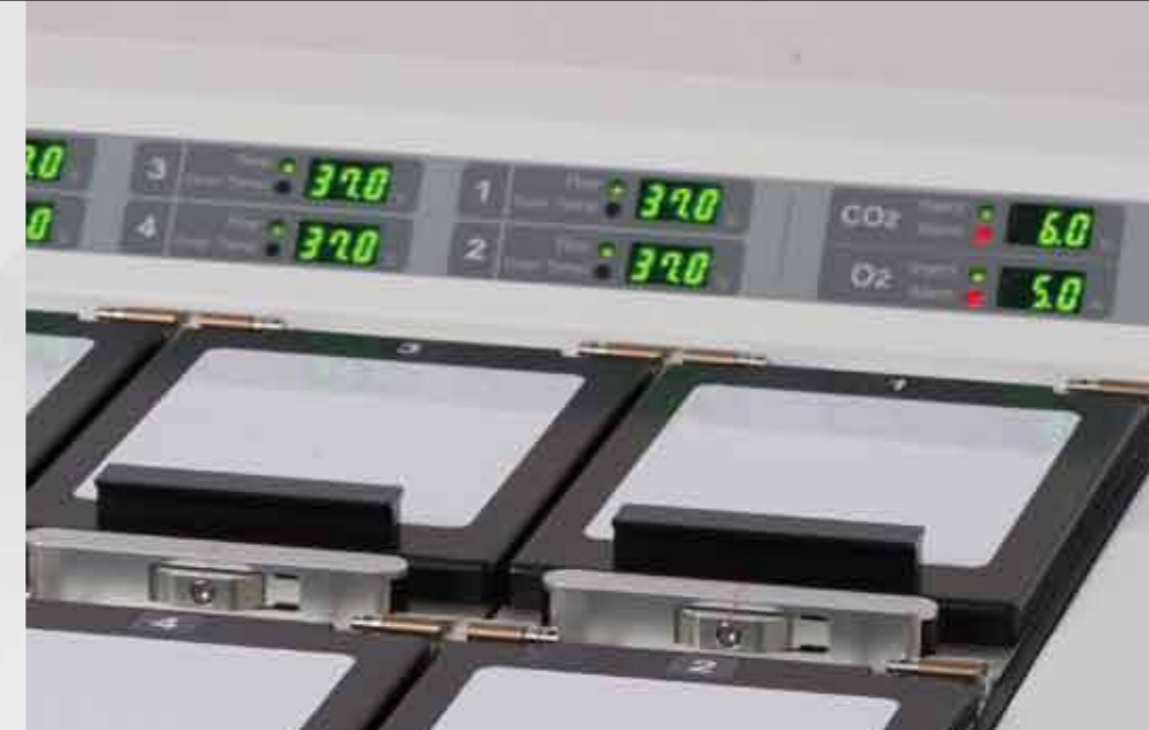
6-independent Culture Chambers with heated lid and bottom surface. Opening a chamber has no effect on the other unopened chambers.

Each Chamber comes with a UNIQUE observation window allowing easy access to the embryo without disturbing it's environment.